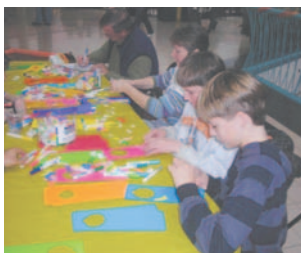
Children working on a variety of projects.

The United Way's Youth Volunteer Initiative (YVI) leveraged nearly 80 volunteers ranging from college and high school students to community volunteers to help run Family Volunteer Day. This includes 40-50 students from Northeastern High School who could not attend the event, but collected gloves, mittens and books on their own time to give to needy families. The Points of Light Foundation provided YVI with free stickers, temporary tattoos, window clings, decorative tins, and Disney's "Incredibles" DVDs to give away to families who volunteered at the event.